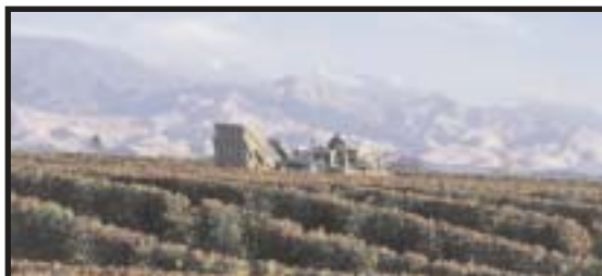
A vineyard in New Zealand's Marlborough region, which is famous worldwide for Sauvignon Blanc.

This 100% Sauvignon Blanc is tank fermented with lees contact, and offers a focused red-pepper and classic grassy nose that carries through on the palate in a clean, crisp, focused style with undertones of white peach and citrus. The wine has an excellent acid structure, lending an affinity for food. A great choice with lobster or crab. Drink now and over the next two to three years.