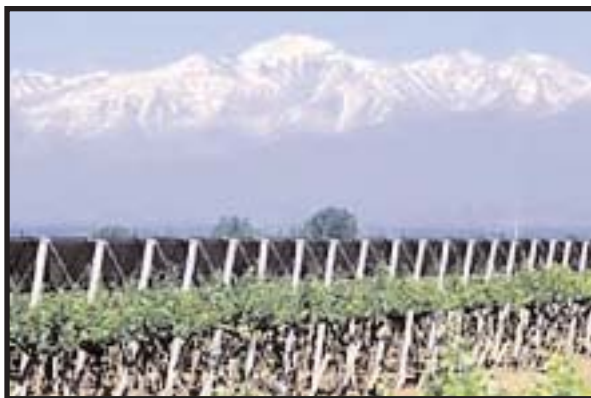
A vineyard in Mendoza, Argentina's principal wine region.

Currently one of the most dynamic wine-producing countries in the world, Argentina is most famous for its juicy Malbec wines. Malbec, a rather obscure grape in France, is used in minor amounts in Bordeaux and known as Auxerrois in Cahors. Though it has never achieved greatness in France, Malbec has become Argentina's flagship single varietal, known as a sublime accompaniment to the local steaks. Argentine wine production was initiated by Spanish colonizers in the 1540s and spread around the country with the Jesuit missionaries. In the 1820s, a huge influx of European immigrants contributed to the growth of the wine industry. The 20th century saw highs and extreme lows for Argentina, but the industry survived and is now growing at record speed. The principal wine region is Mendoza, with 90% of wine production; top wineries include Norton, Trapiche, Weinert and Navarro. Mendoza is a spectacularly beautiful area close to the eastern Andes, which separate Argentina from Chile. Argentina long concentrated on quantity rather than quality in its wines, but in the beginning of the 1990s it began to produce higher quality wines such as Chardonnay and Cabernet Sauvignon to meet growing worldwide demand for quality. Now, Argentinean wineries have embarked on a program of modernization of their winemaking infrastructure as the country continues to focus more and more on the export market.